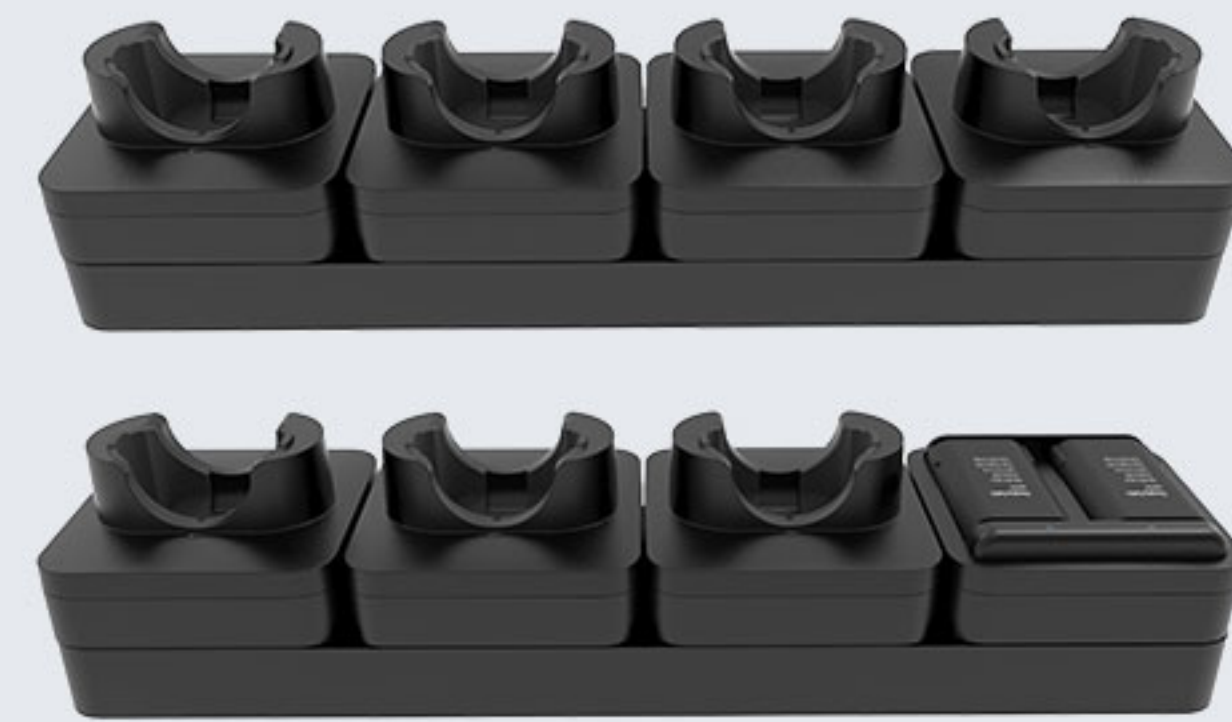
CRD-MCB The base of 4-slots charging cradle set for 4 pieces of cradle, use with DCPWR-12V5A-XX adapter. For load balance, recommendation: 1. 4x cradle for device 2. 3x cradle for device + 1x cradle for main battery 3. 2x cradle for device + 1x cradle for main battery + 1x cradle for pistol battery