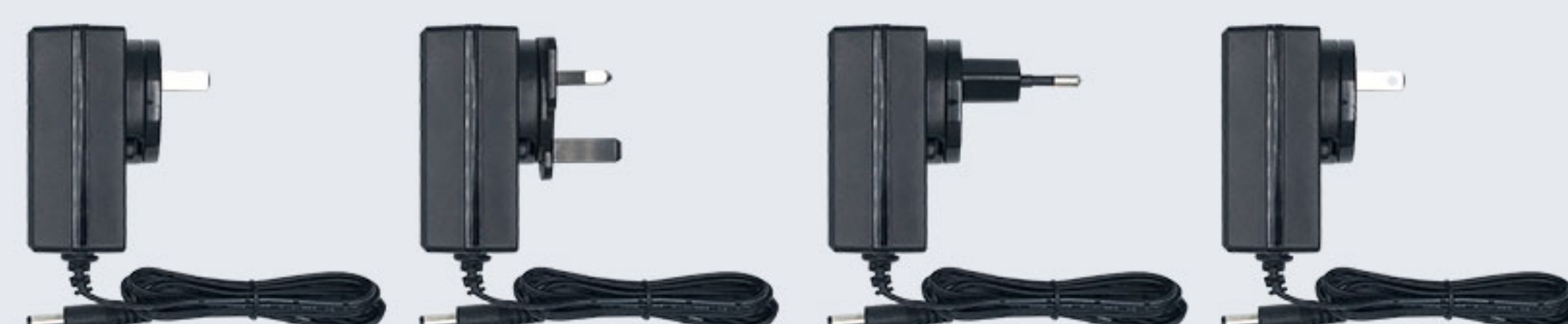
DCPWR-12V2A-XX Adapter(CN/EU/UK/US), I/P: 100-240V, O/P: 12V2A, DC