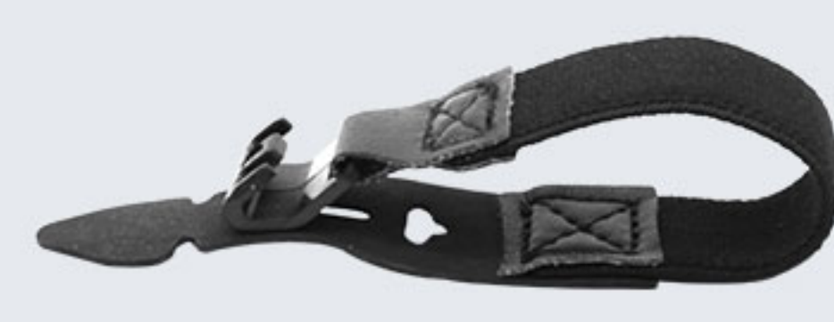
RB-C61-HS hand strap